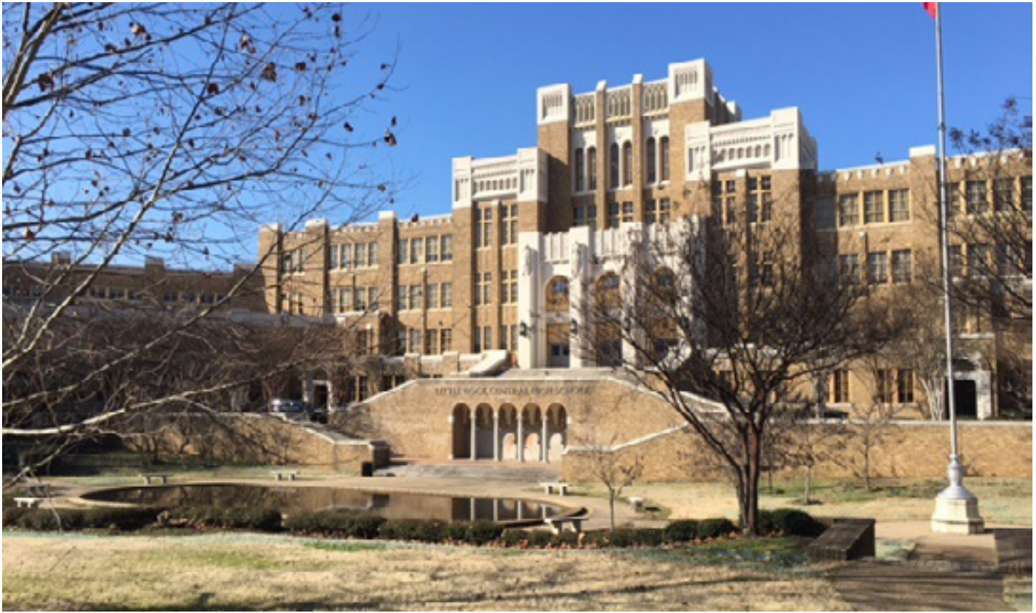
Little Rock Central High School National Historic Site