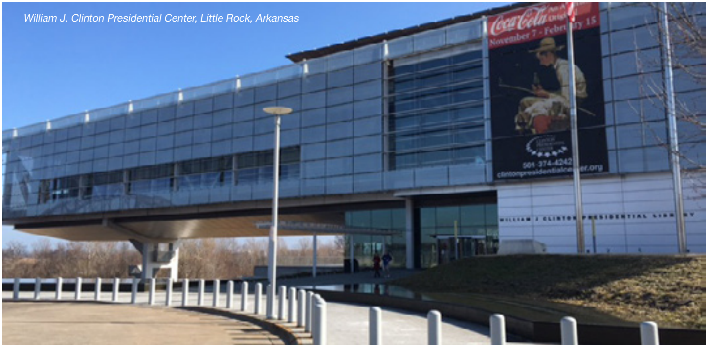
William J. Clinton Presidential Center, Little Rock, Arkansas

At the present time there is no option for an on-line registration. You must print the attached form and complete it manually. Registrations can only be done by mail, fax, or telephone to our office in Houston.