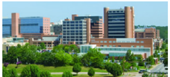
University of Arkansas for Medical Sciences