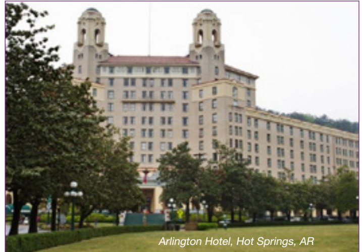
Arlington Hotel, Hot Springs, AR

The Little Rock Central High School National Historic Site was the scene of the desegregation crisis in 1957 that