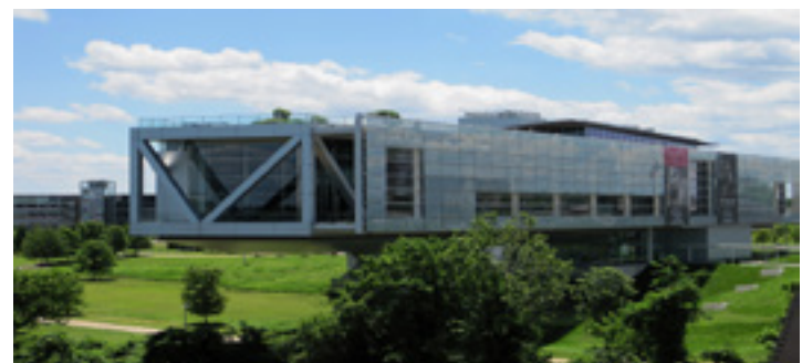
William J. Clinton Presidential Center