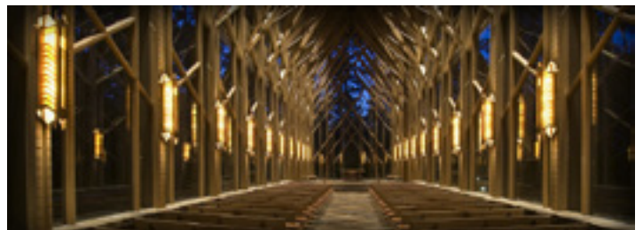
Garvan Woodland Gardens (Anthony Chapel)—Auxiliary event Saturday