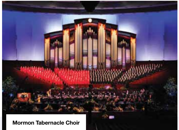
Mormon Tabernacle Choir